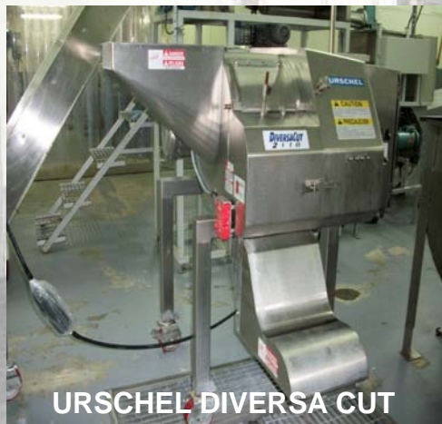
URSCHEL DIVERSA CUT