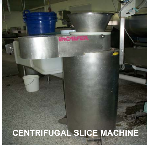
CENTRIFUGAL SLICE MACHINE