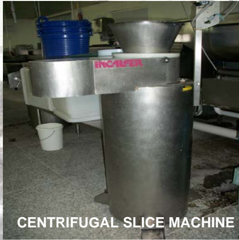
CENTRIFUGAL SLICE MACHINE