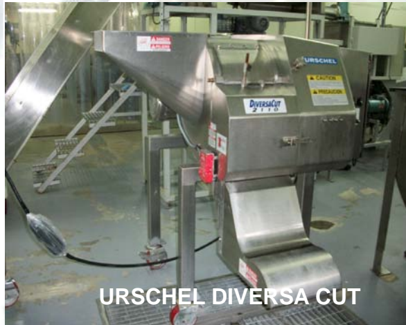
URSCHEL DIVERSA CUT