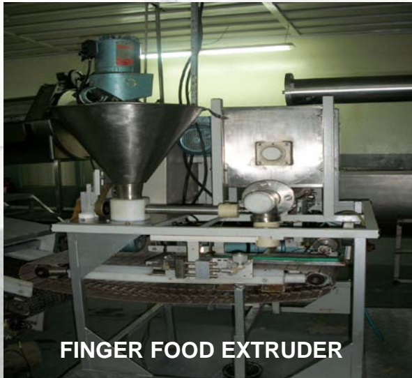
FINGER FOOD EXTRUDER