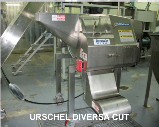
URSCHEL DIVERSA CUT