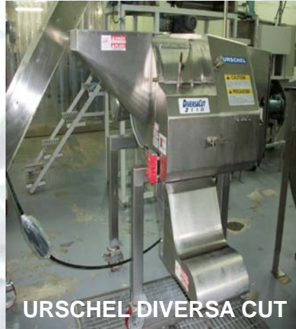
URSCHEL DIVERSA CUT