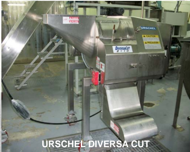
URSCHEL DIVERSA CUT