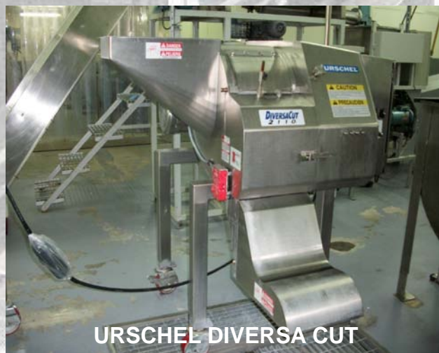
URSCHEL DIVERSA CUT

This product is cut by Urschel Diversa Cut in 1 ½" x 1 ½".