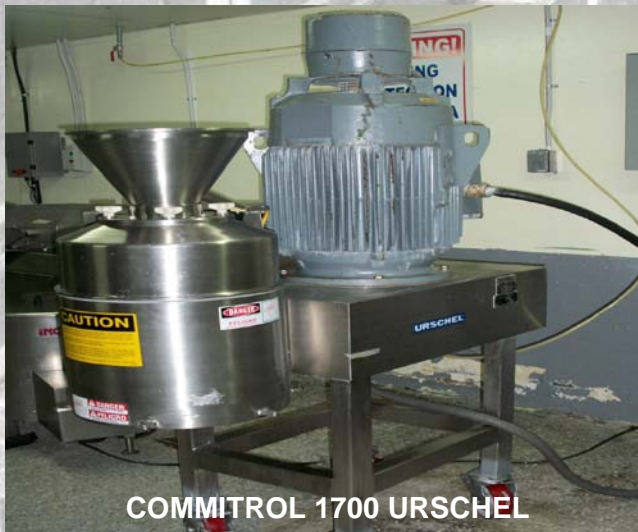
COMMITROL 1700 URSCHEL