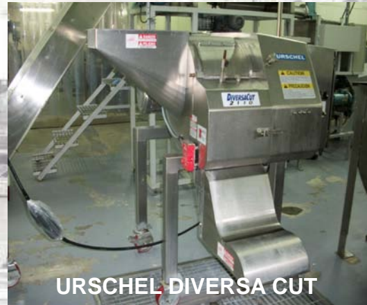
URSCHEL DIVERSA CUT