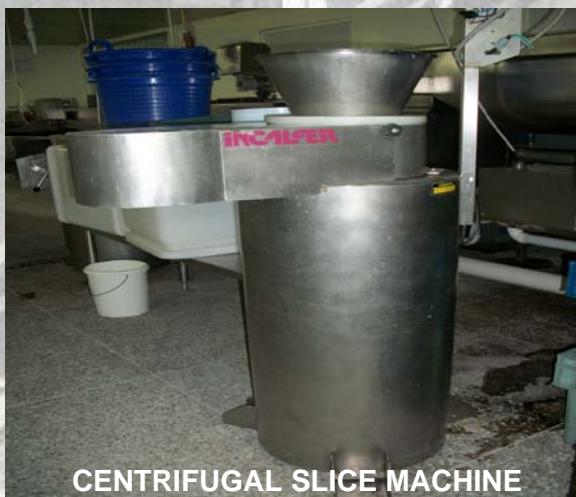
CENTRIFUGAL SLICE MACHINE