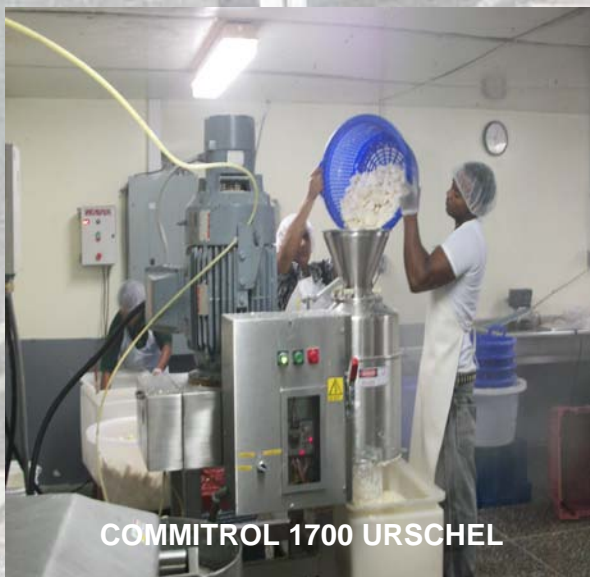
COMMITROL 1700 URSCHEL